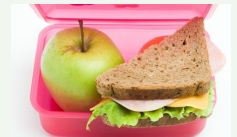
Or you can bring your own packed lunch