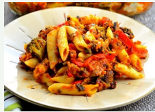
Vegetarian hot dinner